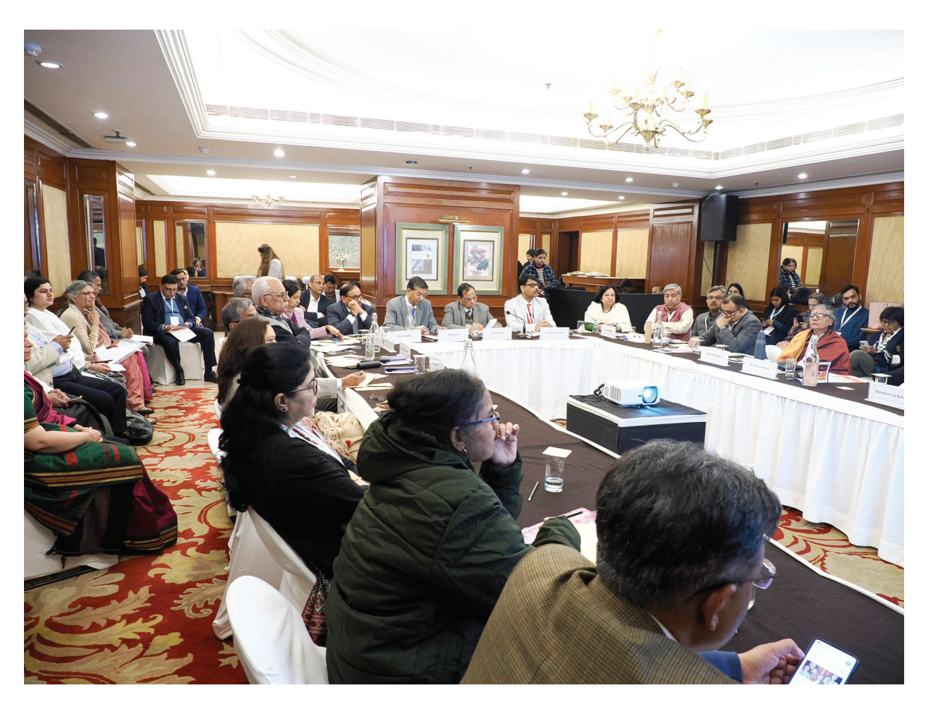
A cross-section of the participants at the seminar

First, he suggested fostering collaboration between youth (30%) and the elderly (70%) in programme design and implementation, to create synergistic outcomes. Second, he recommended that NITI Aayog and the Ministry of Corporate Affairs actively leverage CSR funding to develop and support elderly care initiatives. Lastly, he emphasised the need to introduce specialised courses on elderly care in premier educational institutions such as IITs and IIMs, similar to the programmes currently being offered by the National Institute of Social Defence (NISD).