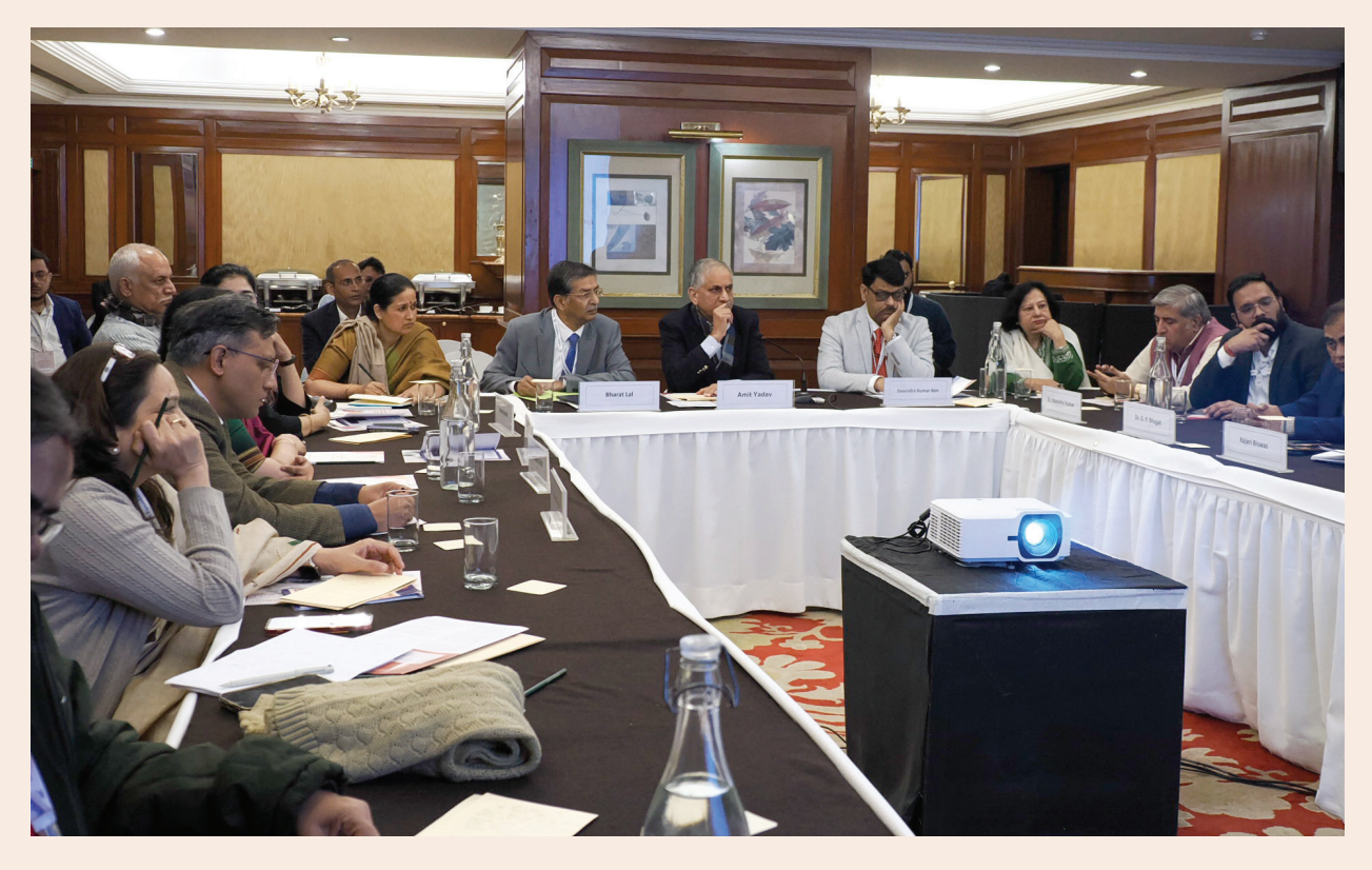
A cross-section of the audience