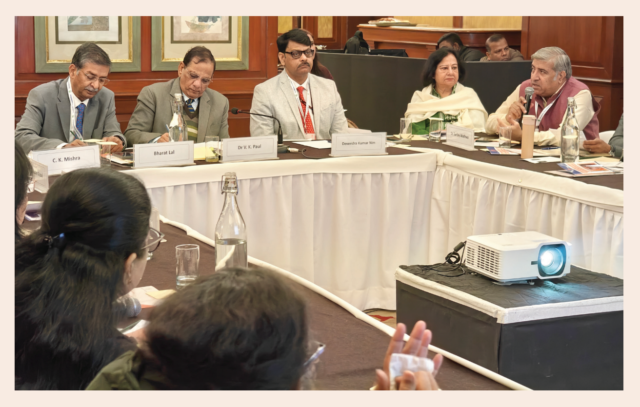
Participants sharing their views during the seminar