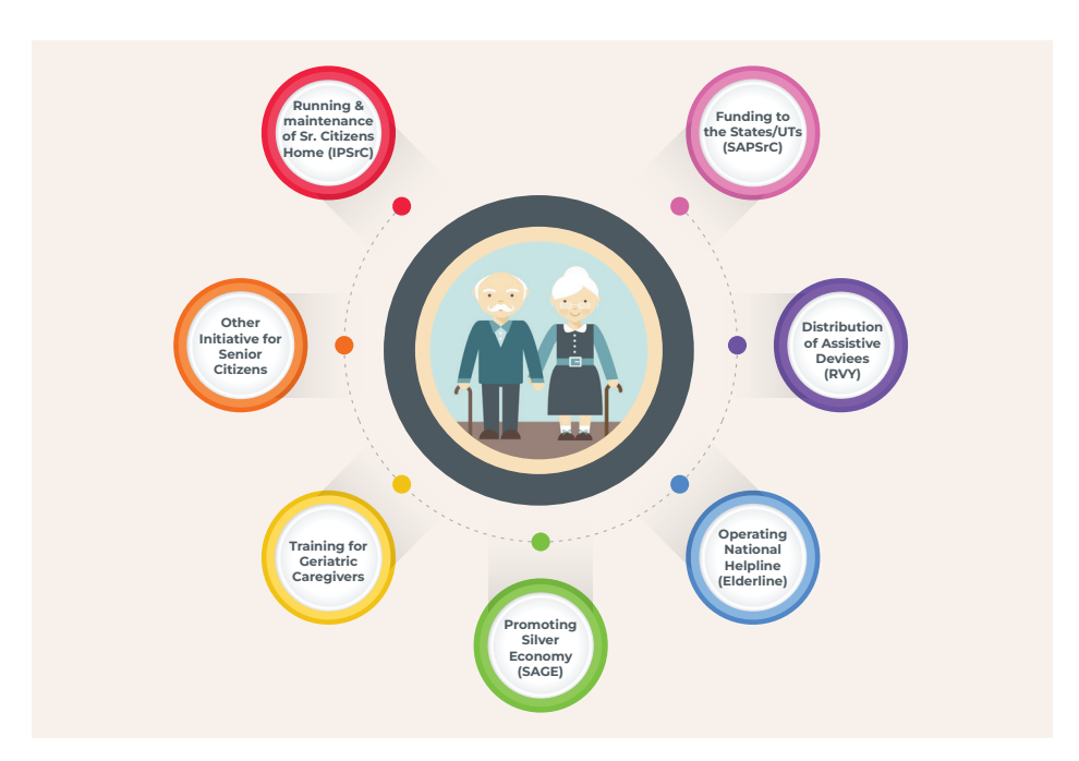
Figure 1: Components of the Atal Vayo Abhyudaya Yojana (AVYAY)

human rights defenders to monitor and advocate for elderly rights. He also mentioned how NHRC makes interventions through advisories and recommendations to government and para-statal organisations on various human rights issues.